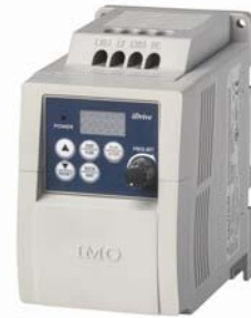
IP20 model shown EDX-040-21-E