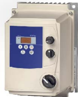
IP65/NEMA4 model shown EDX-040-21-E-N4S