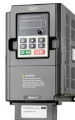
iDrive 2 shown with C3 Filter