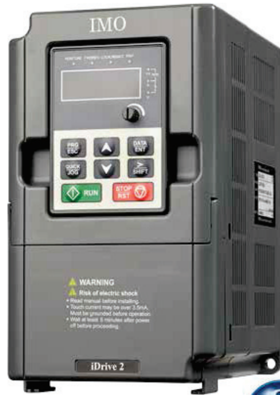
iDrive 2 shown without filter